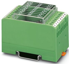
Diode module, with 8 diodes, individually wired, diode type 1N 4007

Please be informed that the data shown in this PDF document is generated from our online catalog. Please find the complete data in the user documentation. Our general terms of use for downloads are valid.