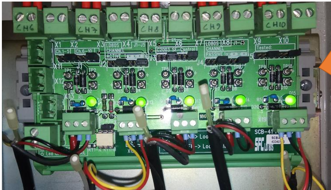
PCB CARD – LEVELDATIC LD80S