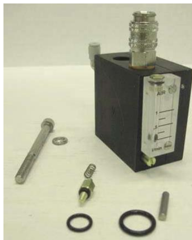
AIR FLOW METER – LEVELMATIC LD80S.